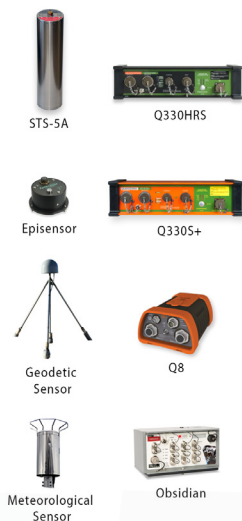
ASPEN FIELD STATION

The communication interface transfers continuous and/or on-demand data to the designated Aspen Data Centers using standard duplex serial interface or typical TCP/IP Level 4 protocol over any available communication hardware.