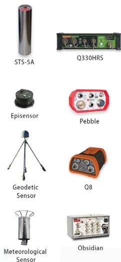
ASPEN FIELD STATION

The communication interface transfers continuous and/or on-demand data to the designated Aspen Data Centers using standard duplex serial interface or typical TCP/IP Level 4 protocol over any available communication hardware.